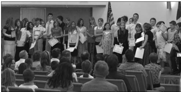
The PLCS Awards Night was a blessing to all who attended, and God was glorified as the stage filled with students who received recognition for memorizing God's Word