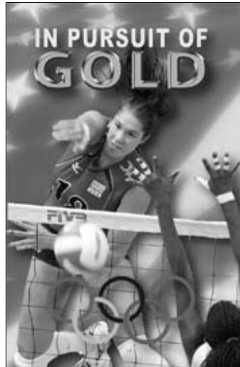
Image from the cover of tract.